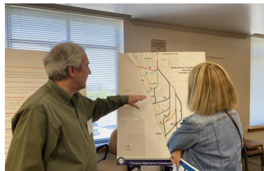
Figure 2. Project Team staff speaking with member of the public at the May 25th Open House

The Virtual Public Open House remained live on the project website for three weeks, between May 25 and June 15, 2022, for the public to review the display boards and to post comments either geographically on the Interactive Comment Map or in the open house Comment Form.