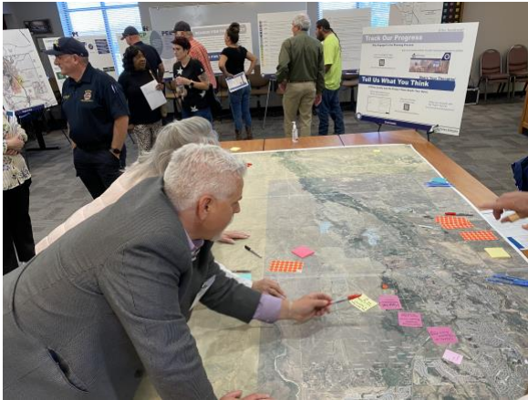
Figure 1. Project Team staff reviewing a large map of the Project Area with members of the public

An in-person Public Open House was held May 25, 2022, and a three-week online Virtual Public Open House to enable broader public participation remained on the project website for three weeks from May 25 through June 15, 2022.